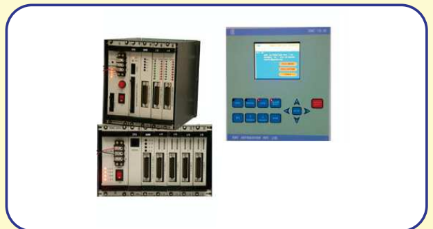
TS - 35

Display : 5.7" Colour TFT with Touch Screen Supply : 24V DC Modular Design with Plug in Cards