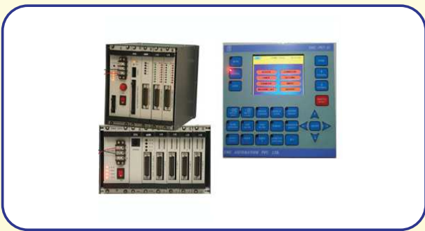
PET - 01

Display : 5.7" Colour TFT with Touch Screen Supply : 24V DC Modular Design with Plug in Cards