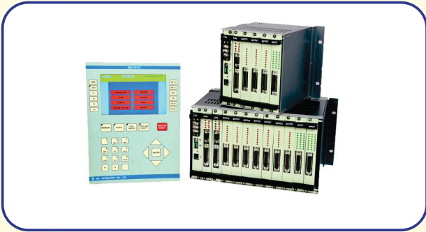
TS - 01

Display : 7" Colour TFT with Touch Screen Supply : 24V DC Modular Design with Plug in Cards