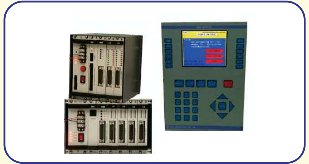
HPTS - 02

Display : 7" Colour TFT with Touch Screen Supply : 24V DC Modular Design with Plug in Cards