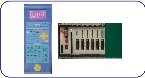
INJ - 02

Display : LCD Display Supply : 24V DC Modular Design with Plug in Cards