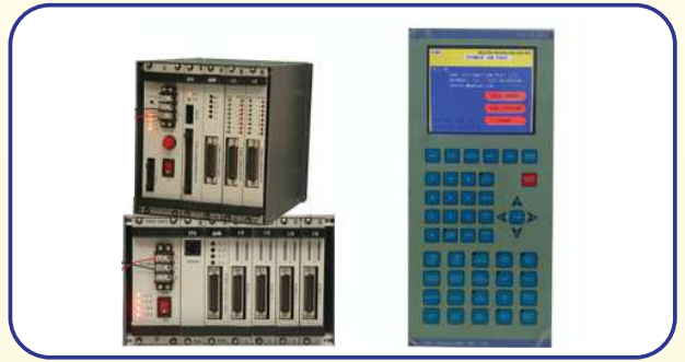
INJ - 57

Display : LCD Display Supply : 24V DC Modular Design with Plug in Cards