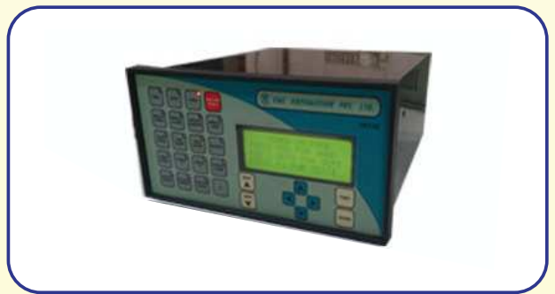
PET - 02

Display : 3.5" Colour Display Supply : 24V DC