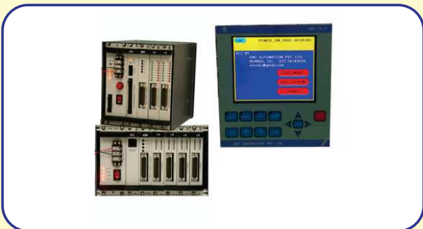
TS - 57

Display : LCD Display Supply : 24V DC Modular Design with Plug in Cards